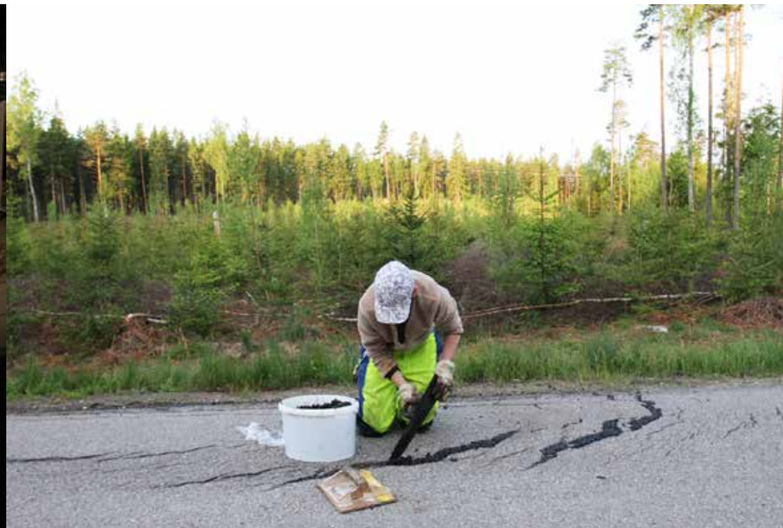
Highway 25, Shared Society Means a Common Debt . In collaboration with Johanna Gustafsson Fürst/Residence-in- Nature (2016). Photo: Johanna Gustafsson Fürst

In the work ( Figure 3582 ) Pleasure Culture , an elderly man is the doing body, meticulously repainting a red-and-white striped fence in the ferry dock in Nowy Port, Gdansk. Nowy Port is a historic site. This is where the Second World War started. It is also where the Solidarity movement of the 1970s and 80s began, followed by an innovative art scene. Today, the area is poverty-stricken, with unemployment and a