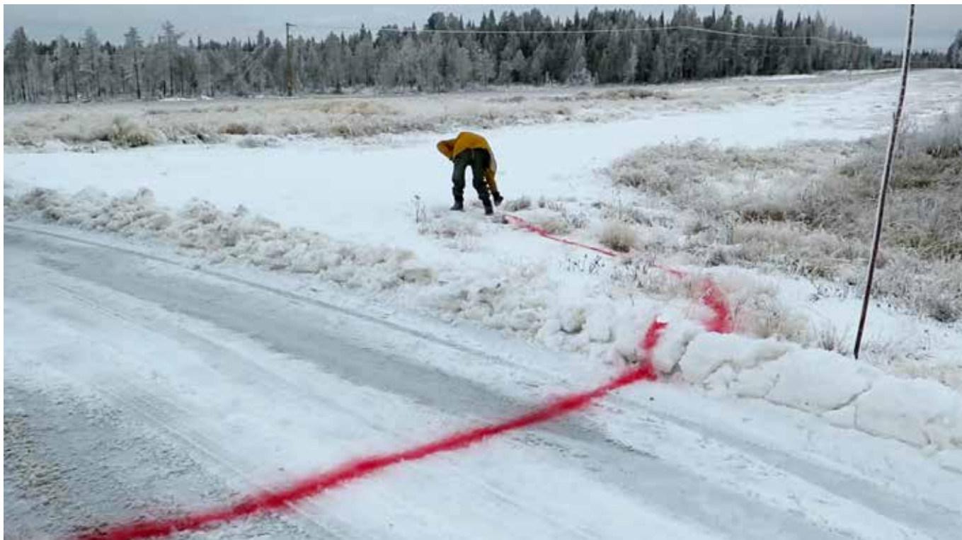
That What Was Seen, Could Be Seen (2018). Residence-in-Nature/ Lainio and Norrbottens Museum, Luleå Biennial 2018.